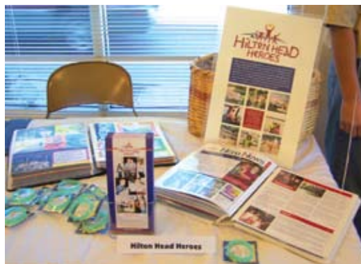
Hilton Head Heroes table at The Bluffton Library "Day of the Family"